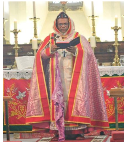
DIOCESAN EPISCOPAL VISIT