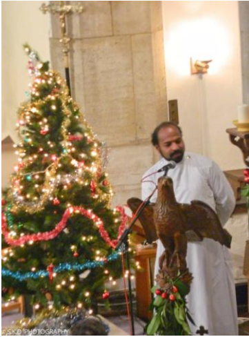
VICAR'S WELCOME SPEECH