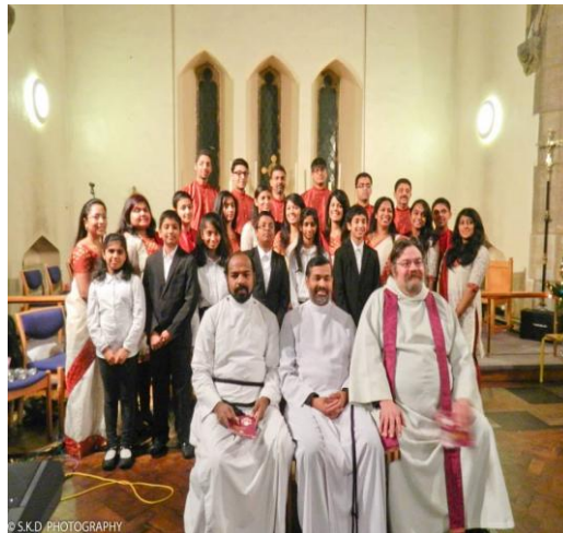
CHOIR MEMBERS & CHIEF GUESTS