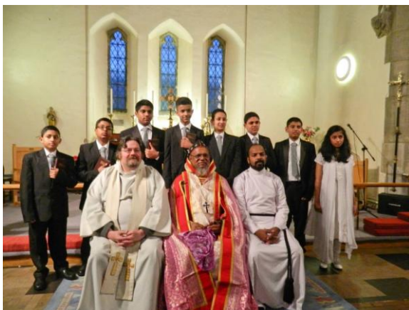
FIRST HOLY COMMUNICANTS