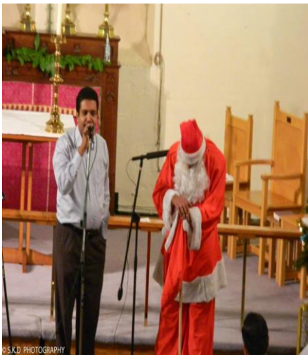
CHRISTMAS FATHER'S VISIT